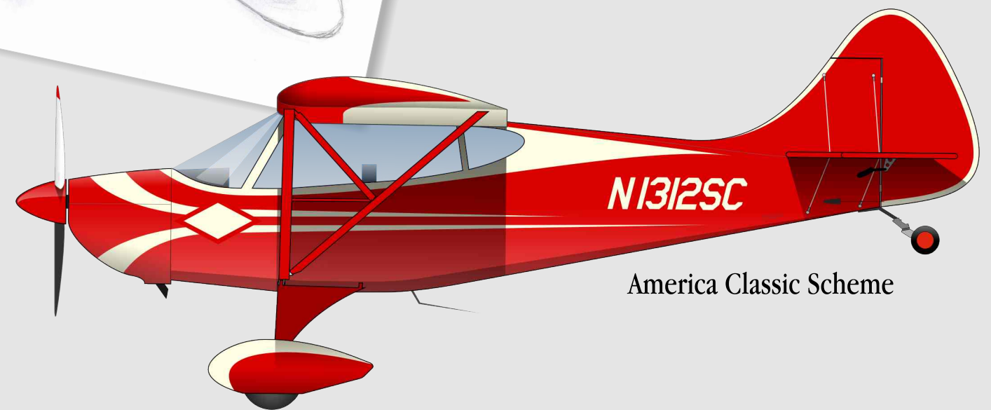
America Classic Scheme